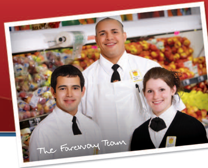
The Fareway Team

If you have the enthusiasm and energy, we may have just the career opportunity you've been looking for.